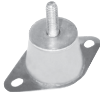
2-4 & 2-5