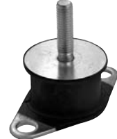
2-7 to 2-10